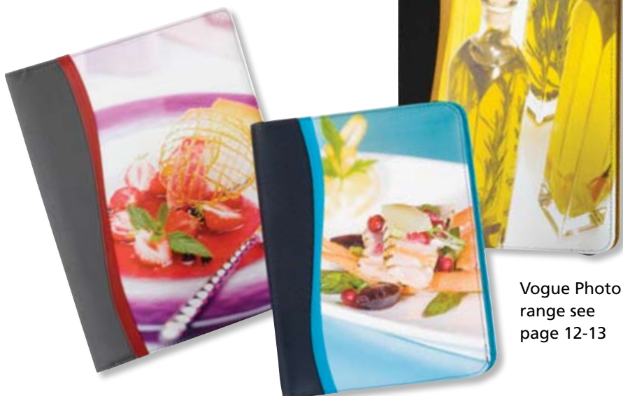
Vogue Photo range see page 12-13

We can uniquely print four colour process logo's and full photographic images on to stitched articles